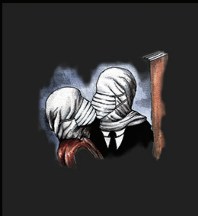
Aaliya Luthro, The Lovers , 2020, Digital Art