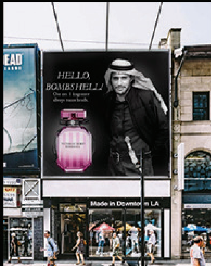
Jenna Sharaf, Untitled , 2020, Digital Art