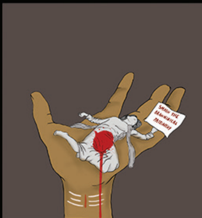
Aaliya Luthro, Untitled #2 , 2021, Digital Art